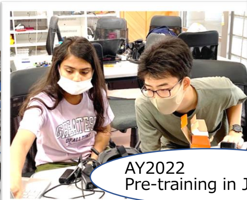
AY2022 Pre-training in Japan