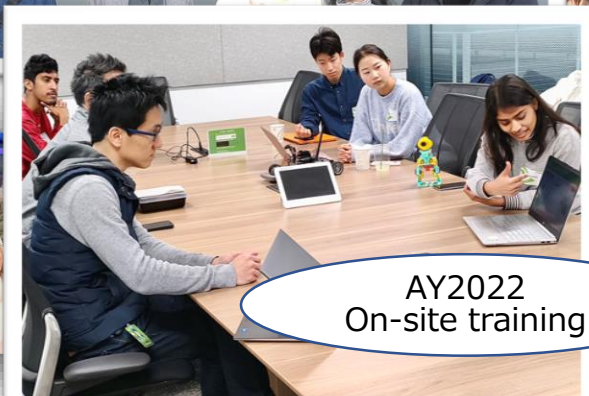
AY2022 On-site training